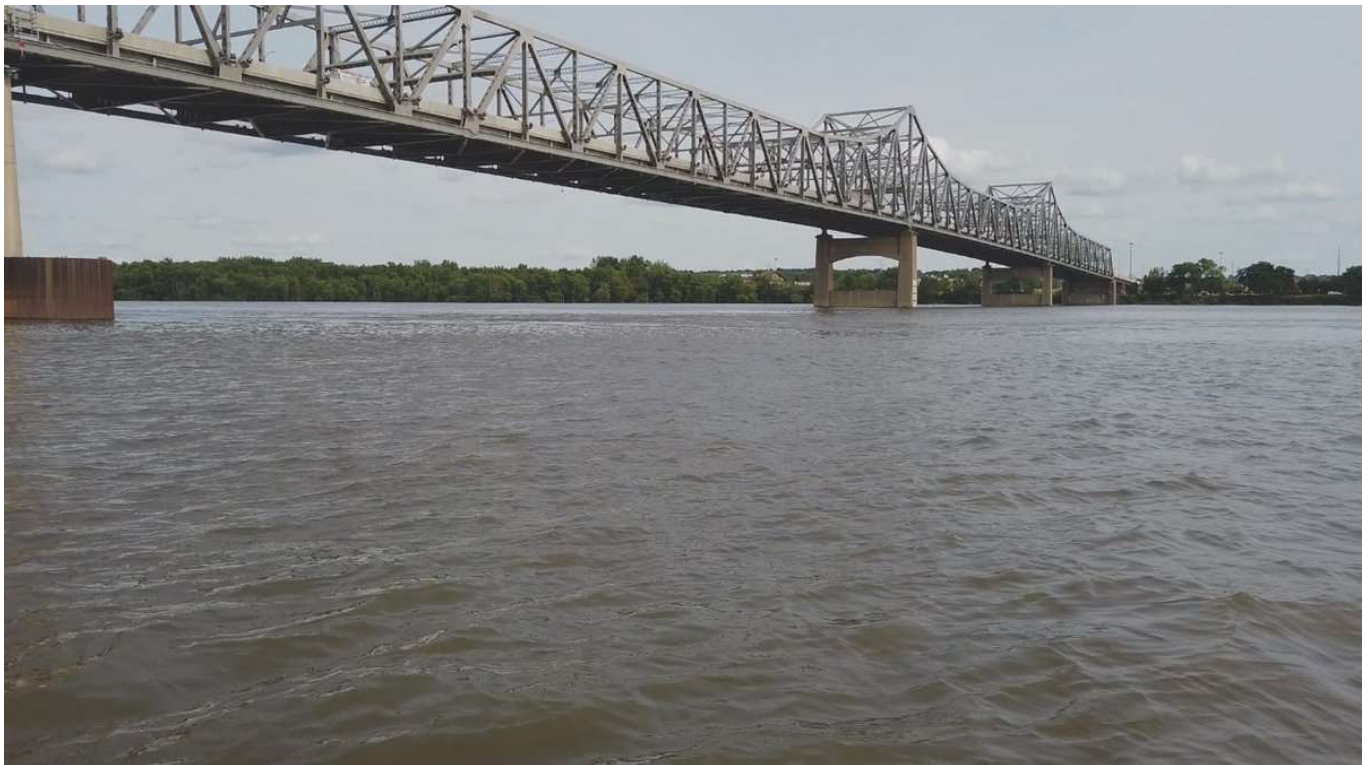
Illinois River