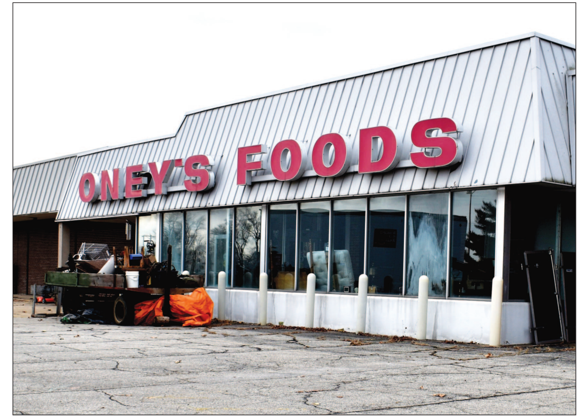
on Promenade Street in Havana will be became "structurally unsafe."